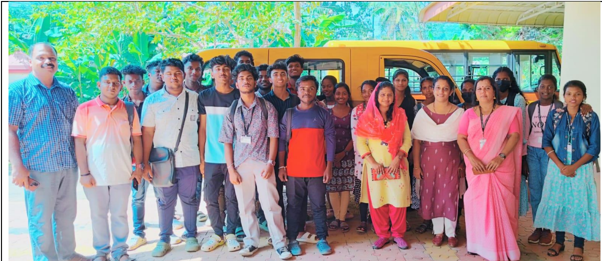
Candle making student team visited 'Prakashadhara special school' on 22.11.2023